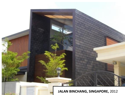
JALAN BINCHANG, SINGAPORE, 2012