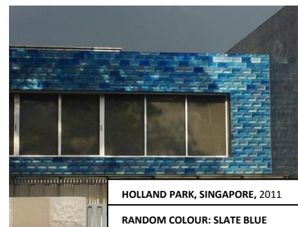
HOLLAND PARK, SINGAPORE, 2011

CONTACT US FOR FREE CONSULTATION, AND QUOTATION FOR DESIGN, SUPPLY & INSTALLATION