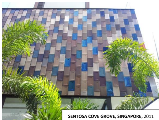
SENTOSA COVE GROVE, SINGAPORE, 2011