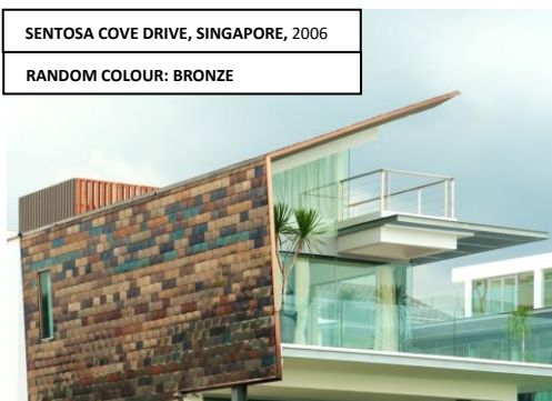
SENTOSA COVE DRIVE, SINGAPORE, 2006